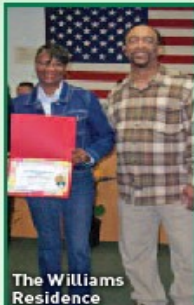
The Williams Residence