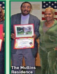
The Mullins Residence