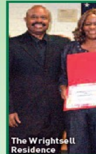
The Wrightsell Residence