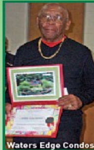
Waters Edge Condos