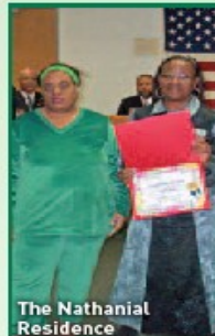
The Nathaniel Residence