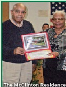
The McClinton Residence