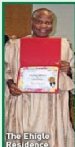
The Ehigle Residence