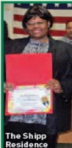
The Shipp Residence