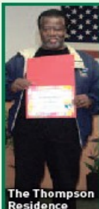
The Thompson Residence