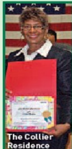
The Collier Residence