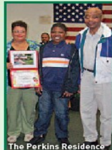
The Perkins Residence